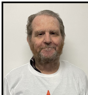
Trust III—Pooled Trust (Funded Entirely with Beneficiary's Assets for Age 65 and Over)

The Life Navigators Special Needs Trust Program is designed to promote comfort and happiness and protect and preserve benefit programs for individuals with disabilities.