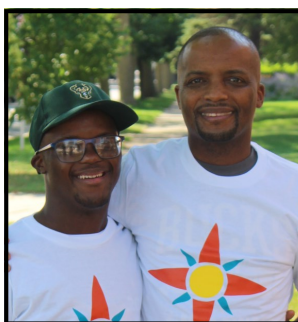
Trust II—Pooled Trust (Funded Entirely with Beneficiary's Assets)