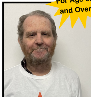
Trust III—Pooled Trust (Funded Entirely with Beneficiary's Assets)