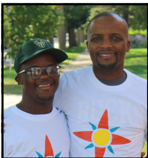
Trust II—Pooled Trust (Funded Entirely with Beneficiary's Assets)