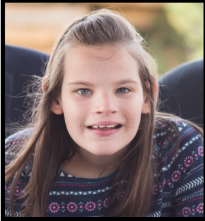
Trust I – Community Trust (Third Party Trust for Futures Planning)

Large and Small — Affordable for Individuals and Families