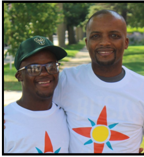
Trust II – Pooled Trust (Funded Entirely with Beneficiary's Assets)