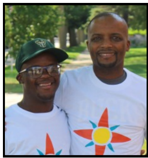
Trust II — Pooled Trust (Funded Entirely with Beneficiary's Assets)