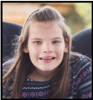
Trust I — Community Trust (Third Party Trust for Futures Planning)

Large and Small — Affordable for Individuals and Families